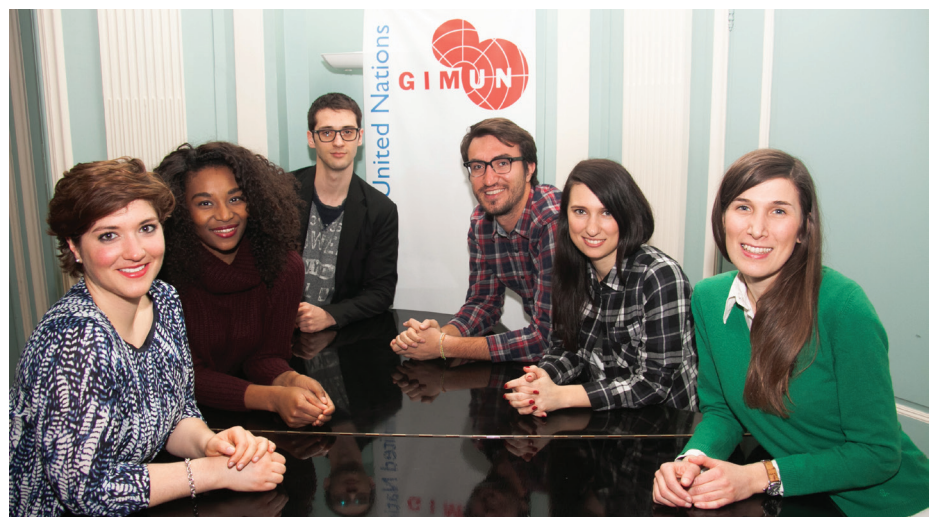
2013-2014 GIMUN Executive Board

GIMUN organises dynamic annual events and they could not be possible without the support of the most loyal and instrumental sponsors and partners that a student-run organization could ask for. It is therefore with much sincerity that GIMUN wishes to thank all our old and new partners and sponsors that have consistently supported us, without whom none of our projects would be possible. Thank you for giving today's Youth opportunities to become tomorrow's leaders!